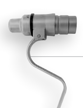
6650 Automatic Pin Driver Coupler