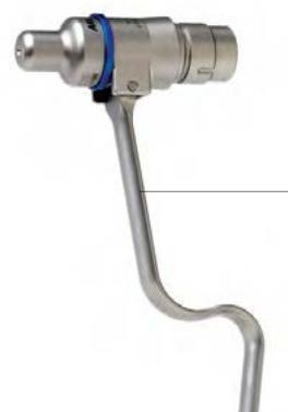
6643-045 Automatic Wire Driver Coupler

Fits 5641 SmartDriver DUO®e Handpiece Only