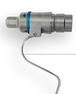
6645 Automatic Wire Driver Coupler

Fits 6643 SmartDriver Duo® Handpiece Only