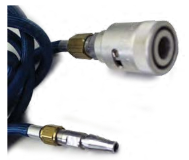
9300-015 Extension Hose (15-foot)